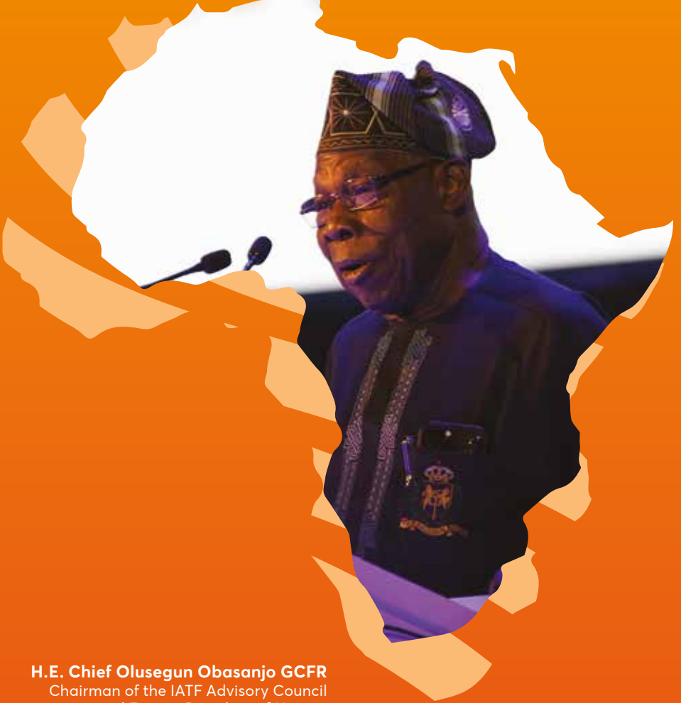
H.E. Chief Olusegun Obasanjo GCFR Chairman of the IATF Advisory Council and Former President of Nigeria

IATF2025 will provide a unique and valuable platform for businesses to access a single African market of over 1.4 billion people with a GDP of over US$3.5 trillion created under the African Continental Free Trade Area.